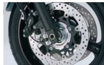
ABS* (Bandit 650SA only)