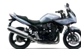
Metallic Aqua Blue (YRB)