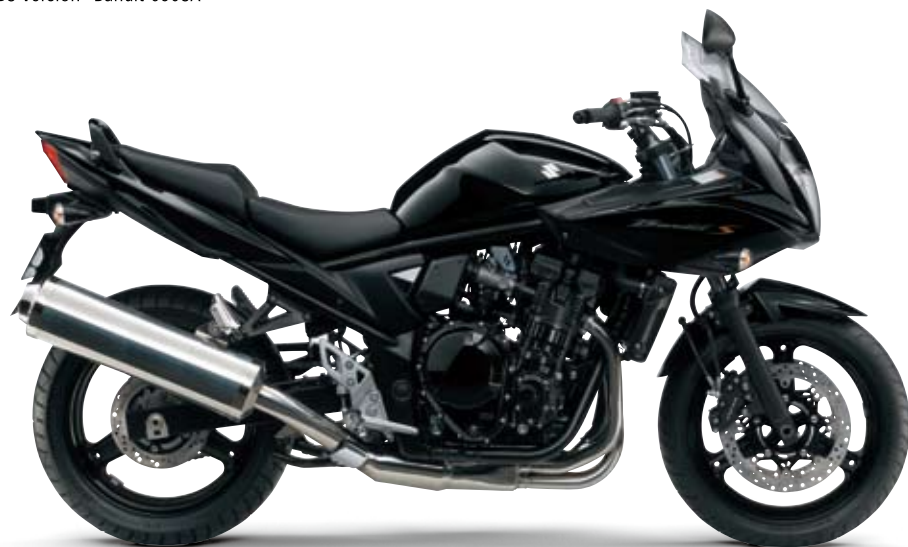
Photo : Bandit 650S