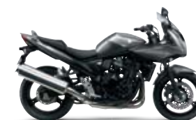
Metallic Thunder Gray (YLF)